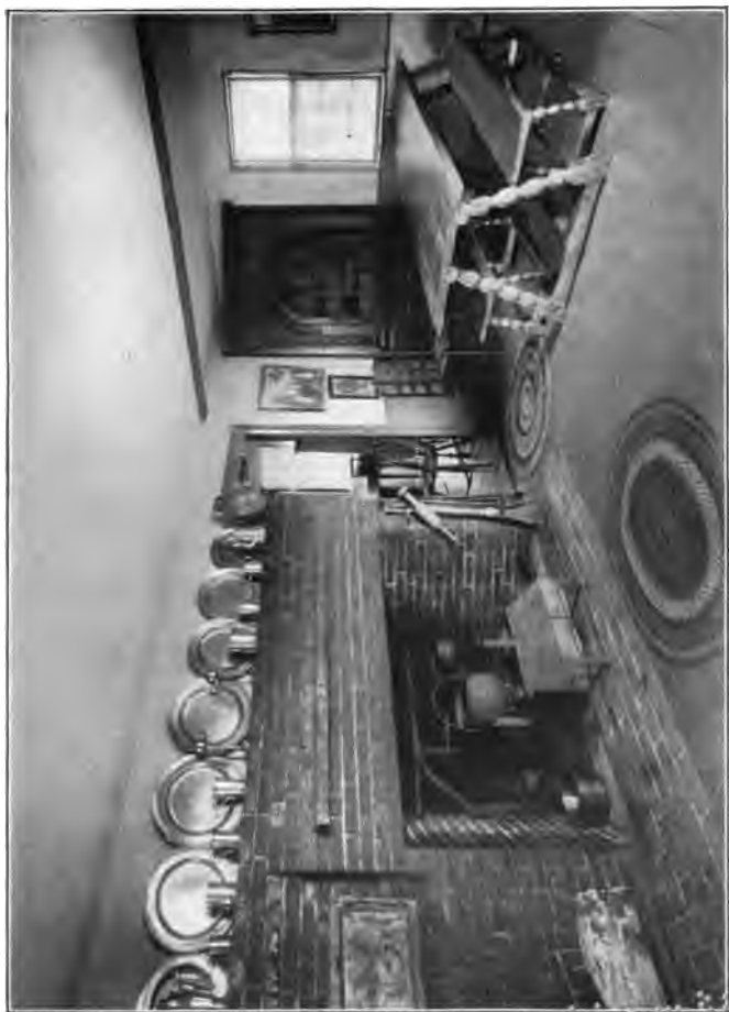
THE REFECTORY, ALSO USED AS A KITCHEN